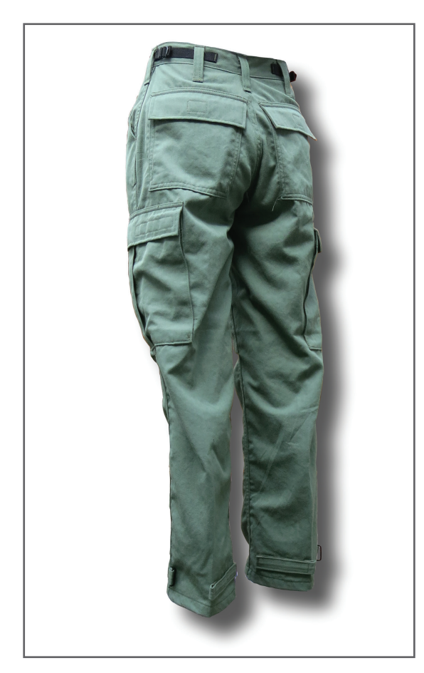
Figure 2–Legacy, unisex, battle dress uniform style pants.