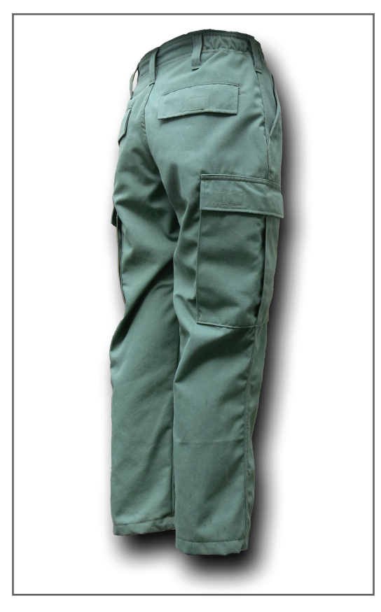
Figure 3—Reintroduced women-specific wildland firefighter pants prototype based on the women-specific army combat uniform.

NTDP equipment specialists reviewed wear test evaluation results, and in January 2021, the Forest Service, Washington Office, Fire and Aviation Management program approved moving forward with developing a new specification based on the ACU-F design. DLA will use the Forest Service specifications for contract manufacturing.