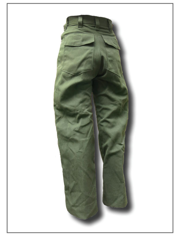
Figure 1—Previous women-specific wildland firefighter pants.

In the 1990s, women-specific wildland firefighter pants manufactured to Forest Service specifications were available through the National Interagency Support Cache (NISC) system and the General Services Administration (GSA) Wildland Fire Equipment Catalog (figure 1). With the redesign of firefighter pants in 1999 to the battle dress uniform (BDU) style, the sales of women's pants dropped drastically. The women's pants option was removed from the system in the early 2000s because most women preferred the unisex BDU-style pants (figure 2).