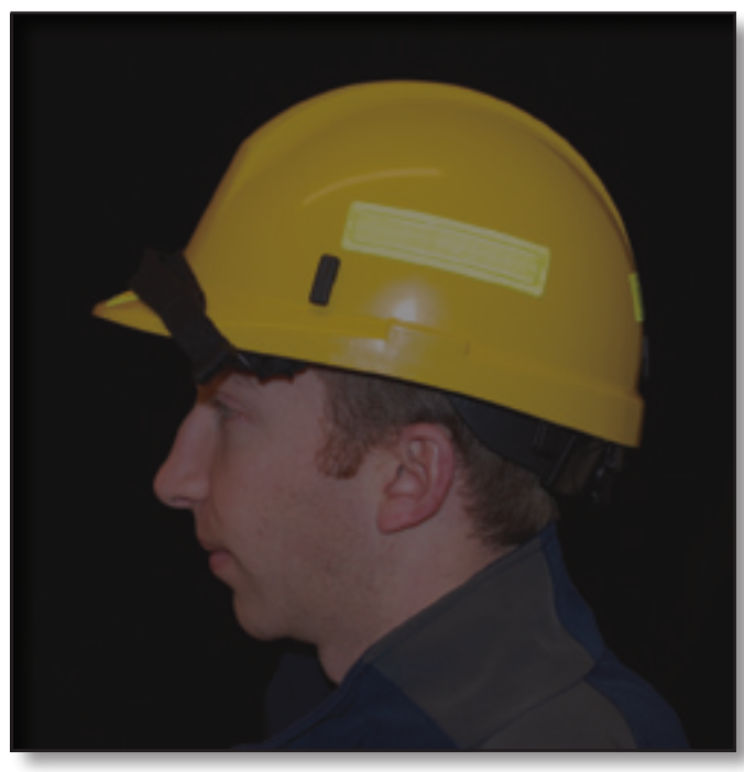
Figure 3—A side view of the Morning Pride hardhat with a front brim.

The Morning Pride hardhat with a front brim (figure 3) costs about $37; the hardhat with a full brim costs about $39.