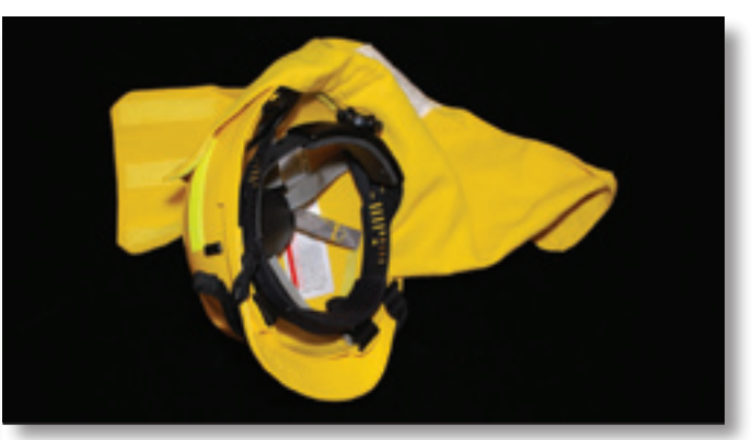
Step 3 — Locate the approximate placement of the side tape strip. Attach the side tape strip far enough below the inner edge of the hardhat to clear the suspension pieces.