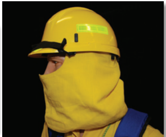
Figure 7—When the face and neck shroud is attached correctly to the hardhat, it will hang in the proper position.