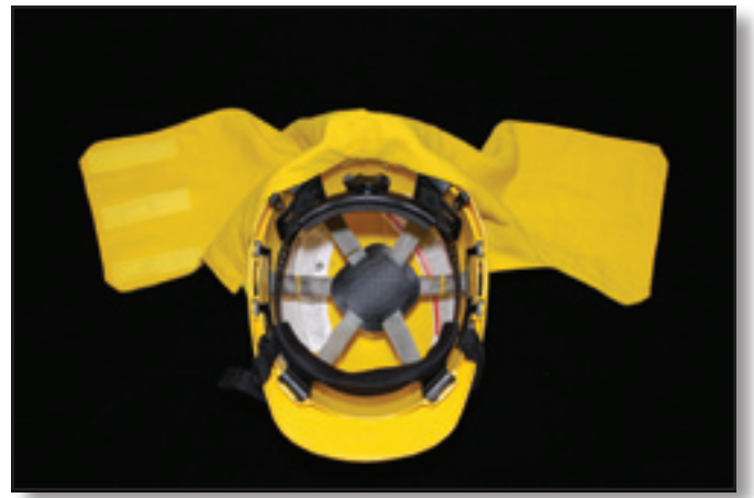
Step 2 —Attach the center loop tab (Velcro) of the shroud to the rear hook tape strip, stretch the sides around, and tuck the shroud material into the hardhat between the shell and the suspension system.