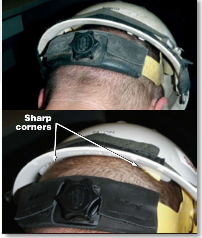
Figure 2—This Bullard hardhat provides adequate space when fully seated on the user's head (top). Less space between the redesigned Bullard hardhat and the user's head can cause pressure points (bottom).

*Bullard hardhats of concern (both cap and full brim styles) are identified in the GSA catalog by the following national stock numbers(NSNs):