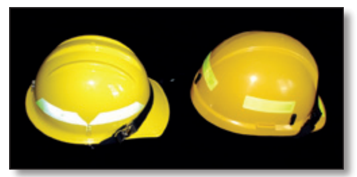
Figure 4—The cap style Bullard hardhat (left) and the Morning Pride front brim hardhat (right) look similar.

The cap style Bullard hardhat and the Morning Pride front brim hardhat look similar (figure 4). The Bullard hardhat has three narrow ridges on top; the Morning Pride hardhat has one wide flat ridge on top and has a shorter brim than the Bullard hardhat.