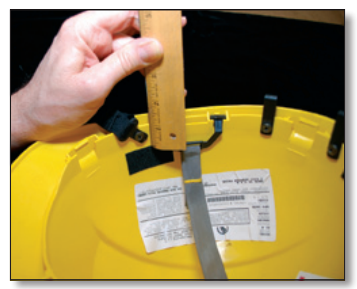
Figure 6—The two side tape strips need to be placed about 1 inch below the inner edge to clear the suspension attachment components.