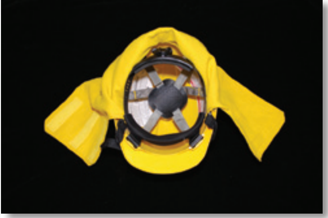
Step 4 —Repeat step 3 for the other side of the hardhat. Make sure that when fully attached, the face and neck shroud hangs properly (figure 7).