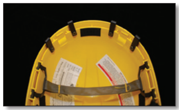
Step 1 —Place one tape strip horizontally inside the hardhat near the inner edge on the rear. Insert the suspension system into the hardhat.